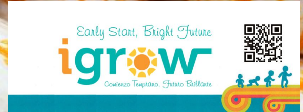
iGrow Birth to 3 Facebook Page